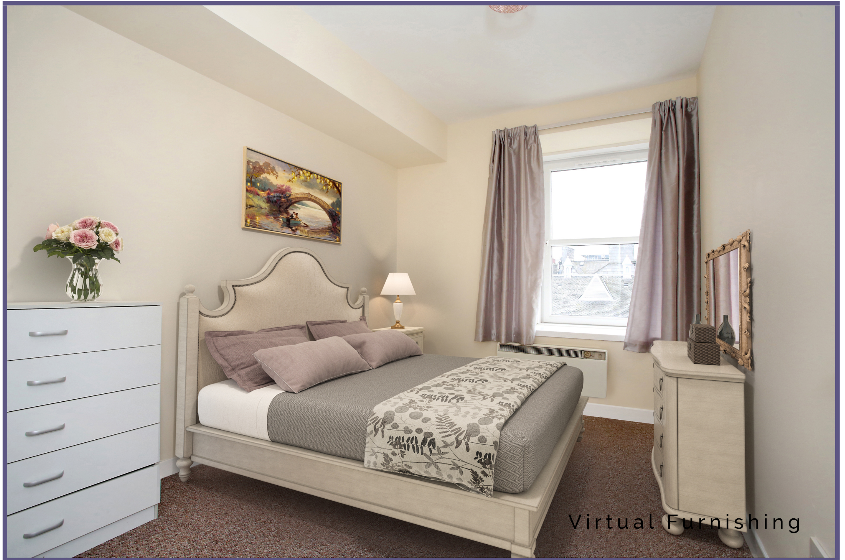
Double Bedroom - Virtual Furniture